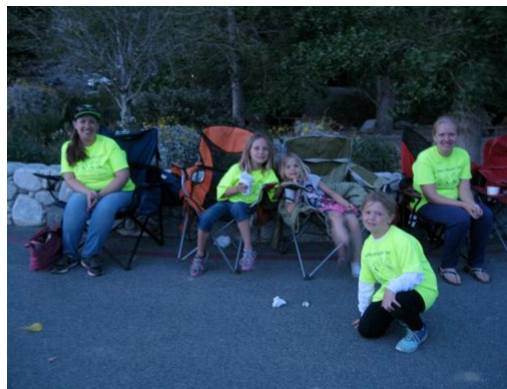
Girl Scouts brightened our evening