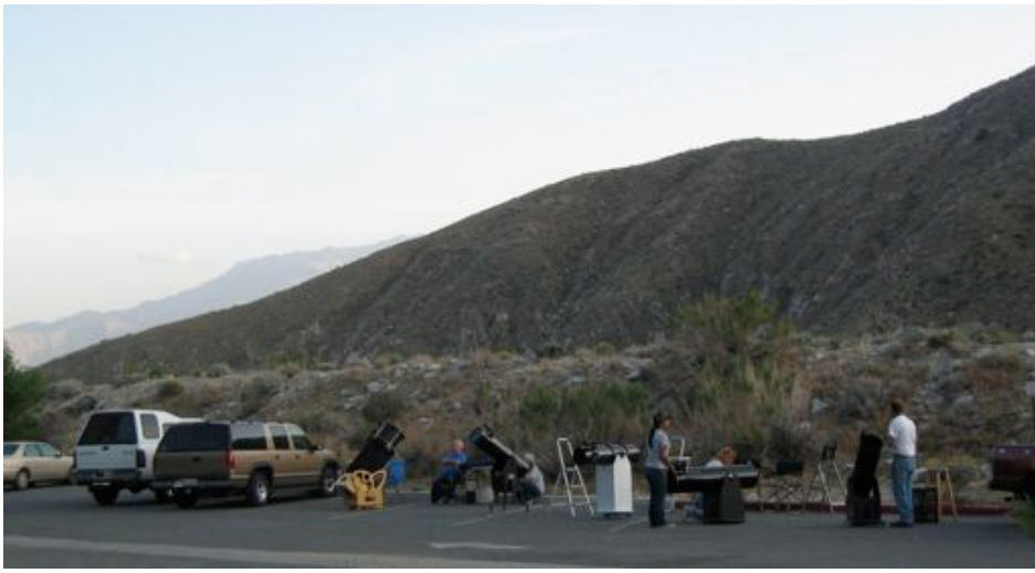
Setting up. The view is toward the SW