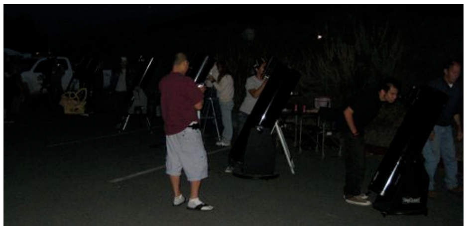
Every scope had a lot of action