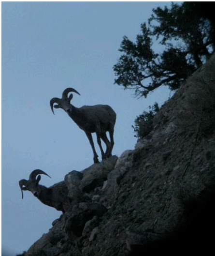
Some of the locals came to check us out