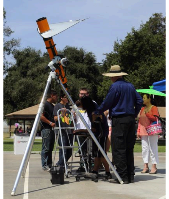
Photos from the April 19, solar outreach at Veteran's Park, Colton, CA. We were part of their Earth Day celebration event.

The photos were taken early before the very sizable crowd descended on us.